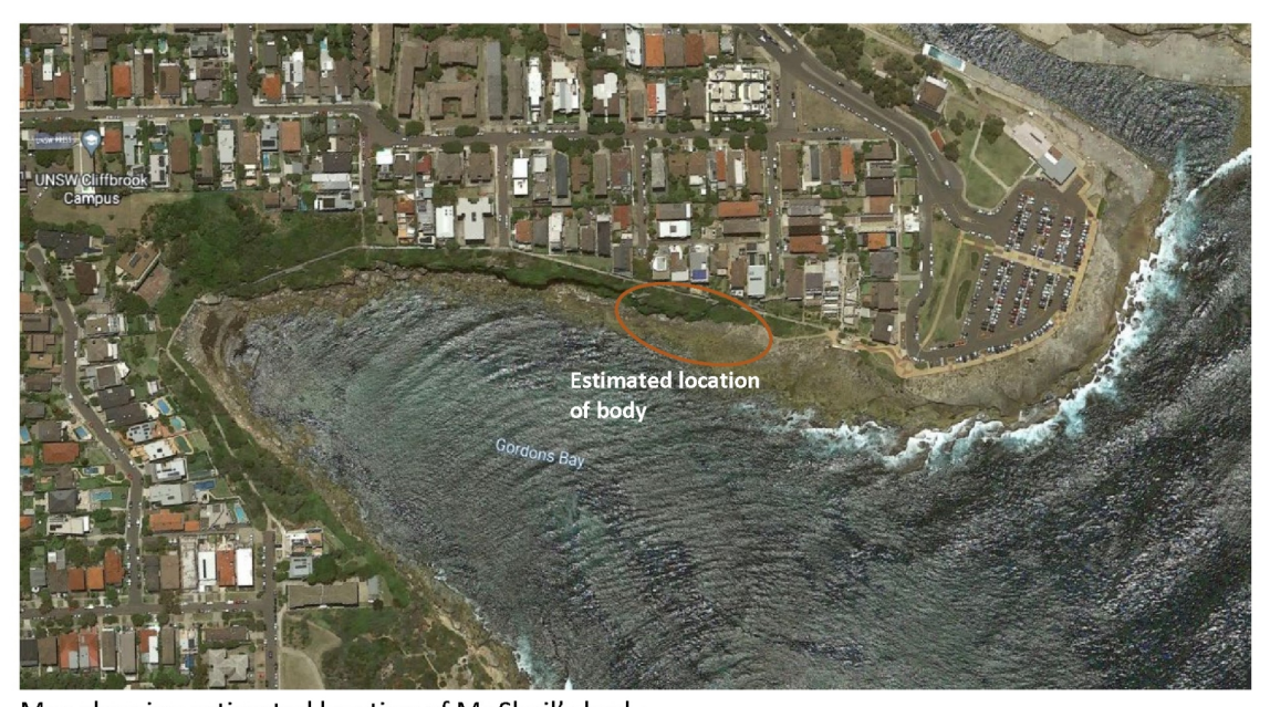
Map showing estimated location of Mr Sheil's body.