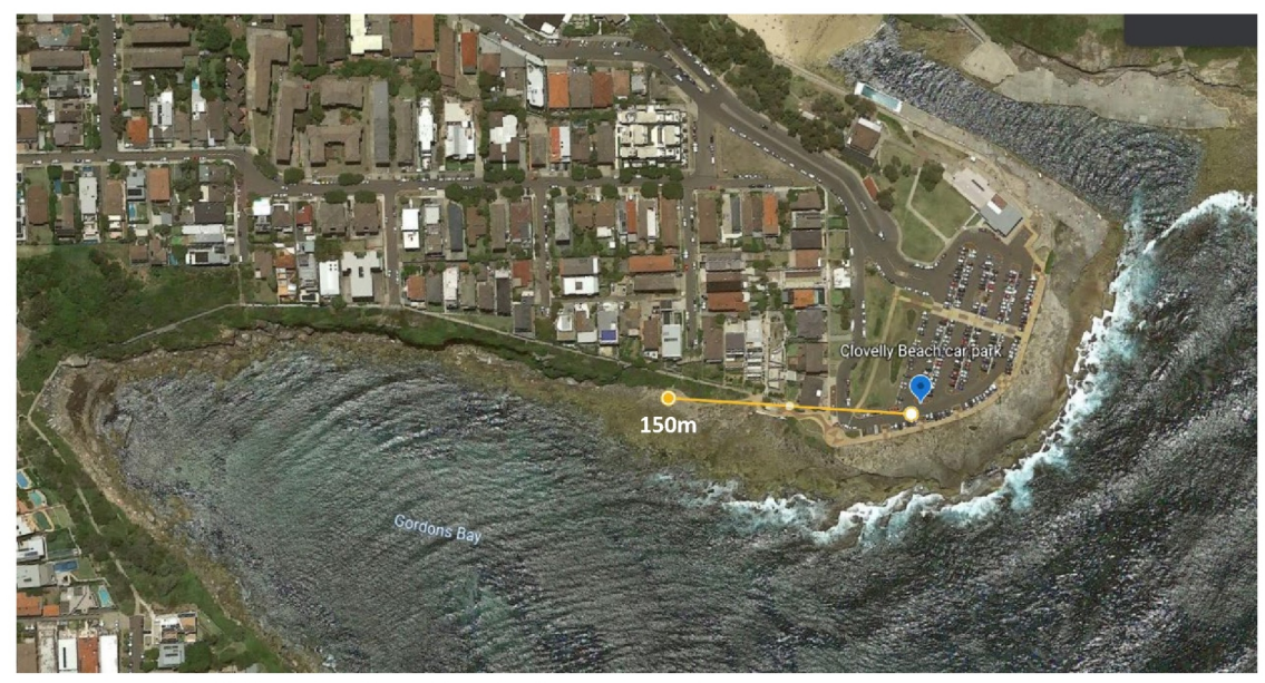
Map measuring 150 metres from Clovelly Beach car park.